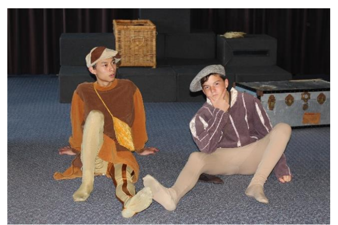
Rosencrantz and Guildenstern are Dead

School Musical: Rehearsals have started for the Gosford High School Musical 'The Wizard of Oz' after an overwhelming amount of talented auditions. This is sure to be an outstanding show!