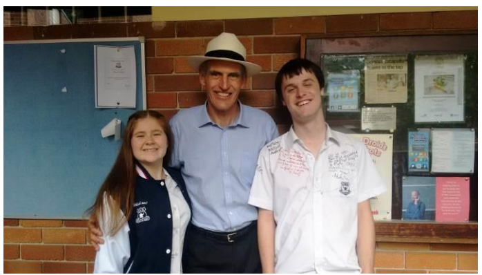
Last day for Year 12

It is with mixed emotions that we say goodbye to Year 12 each year. It is sad to say goodbye but it is impossible not to feel excited for the students and the exciting futures that await them. The Year 12 science teachers have worked incredibly hard this year preparing the students for the HSC and I would like to take this opportunity to thank all the staff for their efforts and to wish all the students well for their final high school exams and for life beyond school.