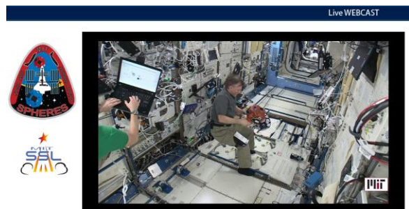
Welcome to Zero Robotics Live Webcast