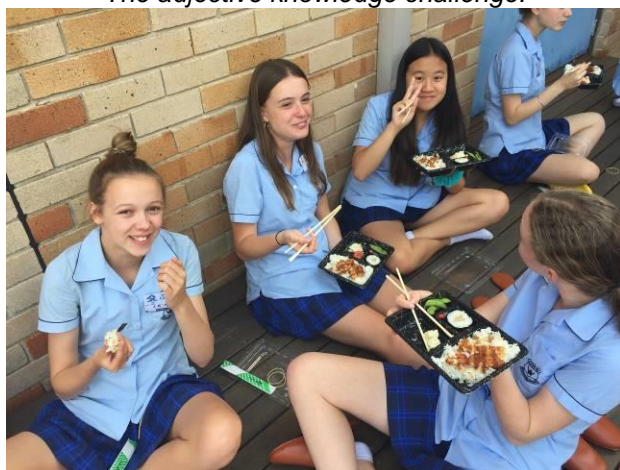
A well-earned 'obentou' break

Years 9 and 10 Japanese students also had a chance to test out their Japanese language skills by attending the Japanese film festival at Event Cinemas in George Street. They watched Oremonogatari (MY love STORY) , a film about teenage school relationships. Afterwards they enjoyed a Japanese lunch box.