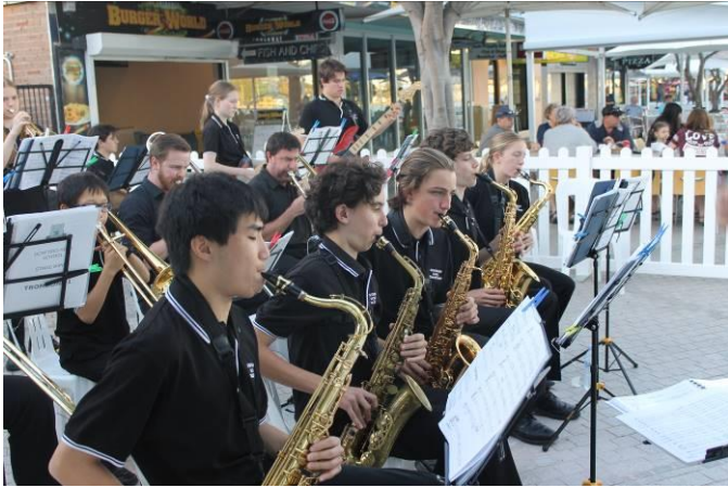
Year 7 2019 Orientation Day, showcased Concert Band 2's performance on the grassed area outside the hall, setting a welcoming and enjoyable atmosphere for families and students as they arrived.