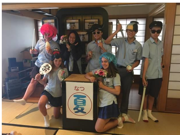
The adjective knowledge challenge!

This term 8S and 8D Japanese classes experienced life "in Japan" for a day by visiting the Japanese Tanken (Experience) Centre on the grounds of Kirrawee High School. Students were immersed in Japanese language, food and culture for the whole day and successfully completed a range of games and activities that tested their proficiency in topics covered throughout the year. The native Japanese speaking staff at the centre were impressed at how well our students were able to synthesise and apply their skills and knowledge to new contexts, with some highly creative dramatic performances to rival those of the staff!