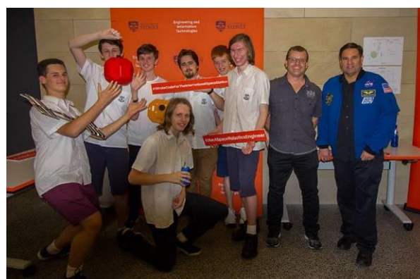
The 2017 GHS international finalist team with former astronaut Dr Greg Chamitoff.